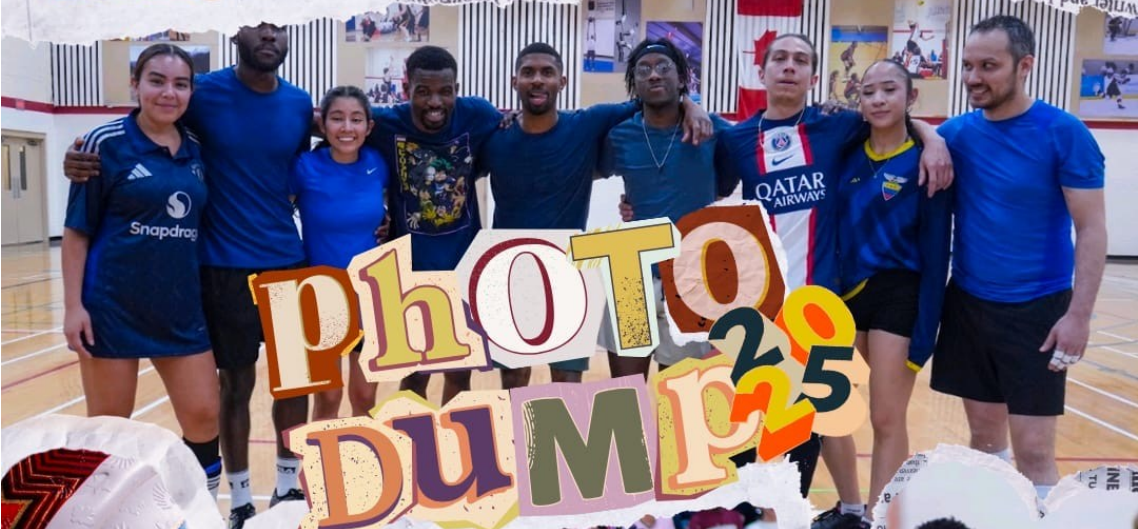
PHOTO DUMP 2025